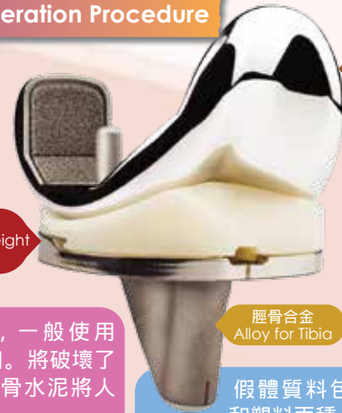
股骨合金 Alloy for Femur